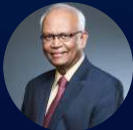
DR. R A Mashelkar Advisor Reliance Industries