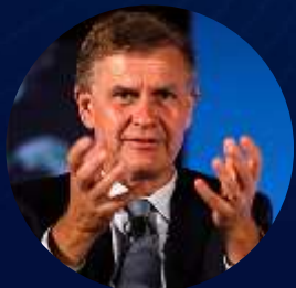
Erik Solheim Chair of Dev Roundtables Green Hydrogen Organisation