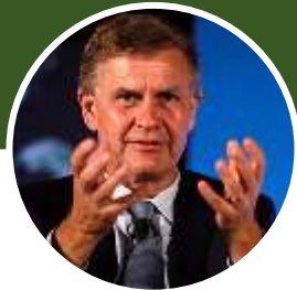
Erik Solheim Former UN Environment Executive Director

The conference was very organized with a stellar band of speakers. Development of green hydrogen in India is the key with set of challenges in production of Hydrogen and its usage.